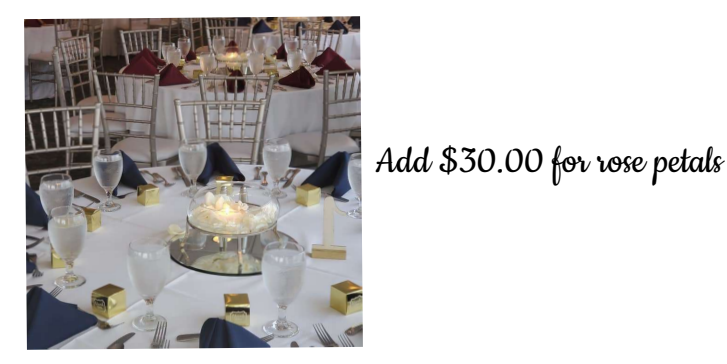
Floating candle centerpiece Standard with 3 candles, stand & mirror bowl width 9 inches, mirror 14 inches