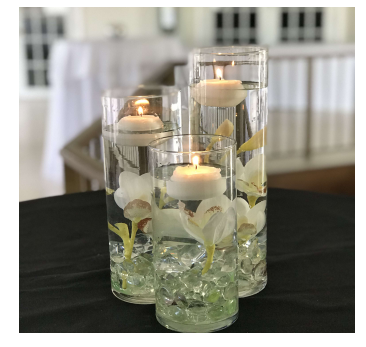
3 Cylinder floating candle centerpiece Standard with marbles, orichid & candle 7.5, 9, 10.5 inches tall