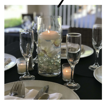
Cylinder floating candle centerpiece Standard with orchid, marbles & candle 12 inches tall x 5 inches wide